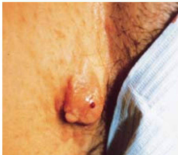
FIGURE 1. A 3-cm by 2.5-cm rock-hard, flesh-colored, dome-shaped, nontender, subcutaneous nodule in the right inguinal area.