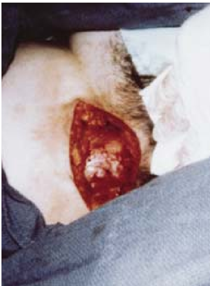
FIGURE 3. Mohs' micrographic surgery defect after 3 stage, 13 section procedure.

The benefit of skin conservation with Mohs' surgery has been demonstrated in DFSP. In a total of 38 Mohs patients, a