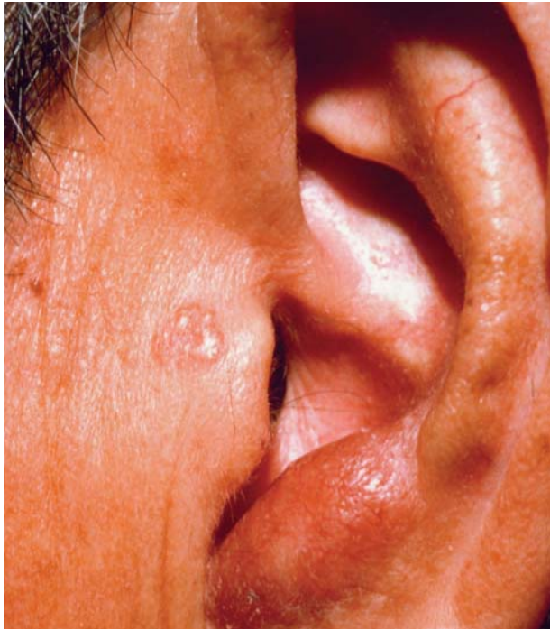
Figure 2. A nodule on the antitragus and a smaller papule on the preauricular region of the left ear.