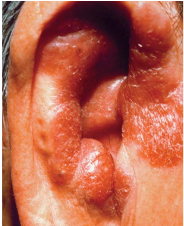
Figure 1. Orange plaques and nodules on the right ear.