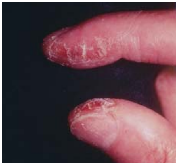
Figure 1. Severe hyperkeratotic eczematous eruption of the patient's thumb and index finger of the right hand.

hand. The remainder of the examination yielded negative results.