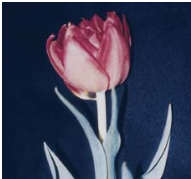
Figure 2. The type of commercial cut tulip used by the patient in arrangements of cut flowers.

Although allergic reactions to tulip bulbs are extremely common in commercial handlers, reactions to cut flowers also occur. 5-7 The hard skin of the bulb, the tecta, seems to be both irritating and the source of the antigen that causes tulip finger. Bulbs are handled in separating "bulblets" and in sorting and preparing bulbs for shipping. Sometimes specialty growers remove the bottom part of the tecta to promote early, synchronized growth. Dust particles in the workplace also may be a source of airborne dermatitis. 8 Bruynzeel 4 says that workers know of tulip finger, but because they are seasonally employed, they handle the problem by stopping work and do not seek medical attention. The pub-