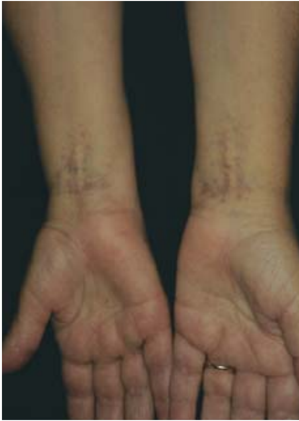
Figure 2. Bilateral, symmetric lesions and residual hyperpigmentation affecting both wrists.

residual hyperpigmentation upon resolution. The left wrist (Figure 2) and ankle only showed atrophic and hyperpigmented areas, without clinically active lesions. There were no lesions of the oral mucosa, genitals, or rest of the body. Physical examination was otherwise normal.