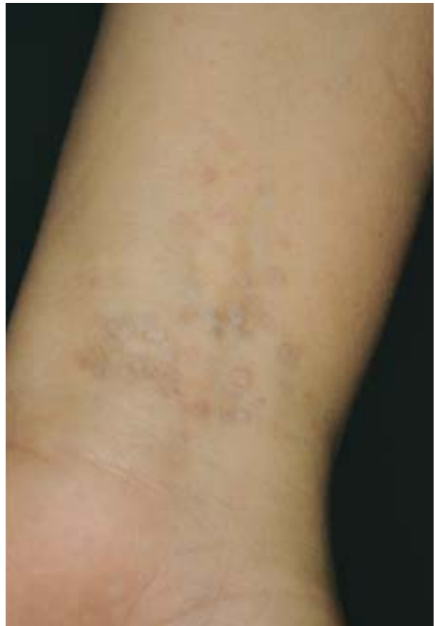
Figure 1. Polygonal papular and centrally depressed lesions on the right wrist.

L ichen sclerosus et atrophicus (LSA) is a disease of unknown yet multifactorial etiology in which hereditary, endocrine, and autoimmune factors are known to be involved. 1,2 The disease tends to affect the anogenital region either alone or in combination with other areas (15.5% of patients). In 2.5% of cases, only extragenital areas are affected 2 in the form of depressed and atrophic, whitish papules or maculae that merge to form larger plaques. The lesions tend to affect the upper half of the trunk, neck, and upper limbs. The face, 3 nipples, 4 wrists, 5 and palmoplantar regions 5-8 are involved less frequently.