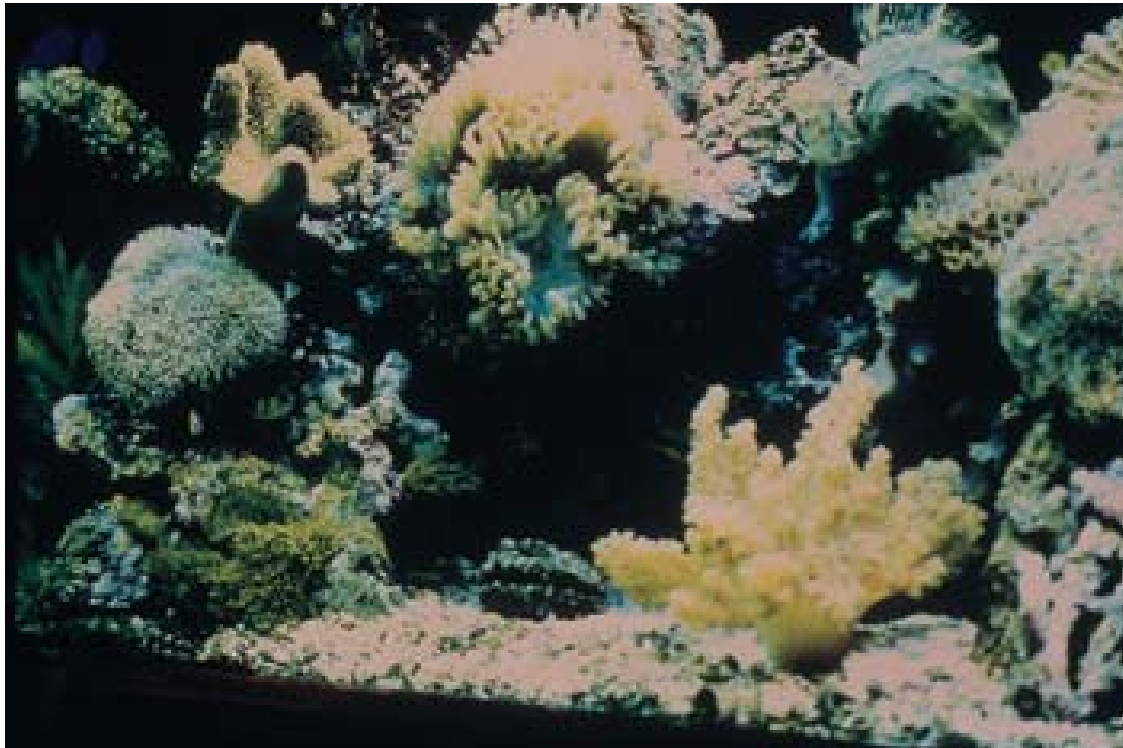
Figure 1. The green color of the tentacles and base of Catalaphyllia is seen in the animal located in the upper mid third of the photograph.

Catalaphyllia jardinei is a blue-green soft coral whose red-violet tipped tentacles have made it a very colorful, popular animal prized by amateur aquarists (Figure 1). Its normal habitat is the Indo-Pacific area from Seychelles through Vanuatu and from Northern Australia to Southern Japan. It is regarded as mildly venomous. However, to our knowledge, no reports exist on its sting's effects on man.