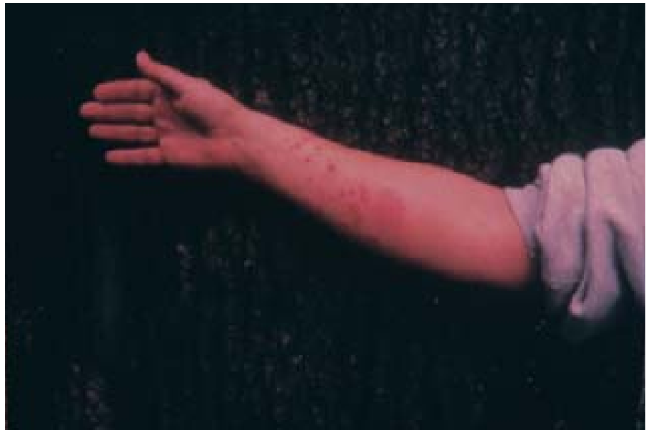
Figure 2. Multiple reddish-brown papules, some of which are in linear pattern, on the volar forearm.