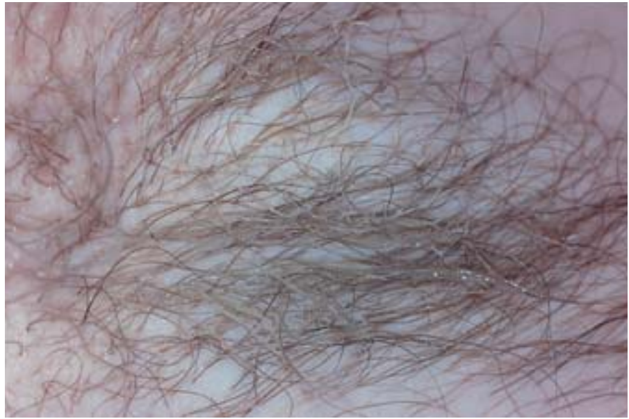
Figure 2. Axillary hair with white piedra.