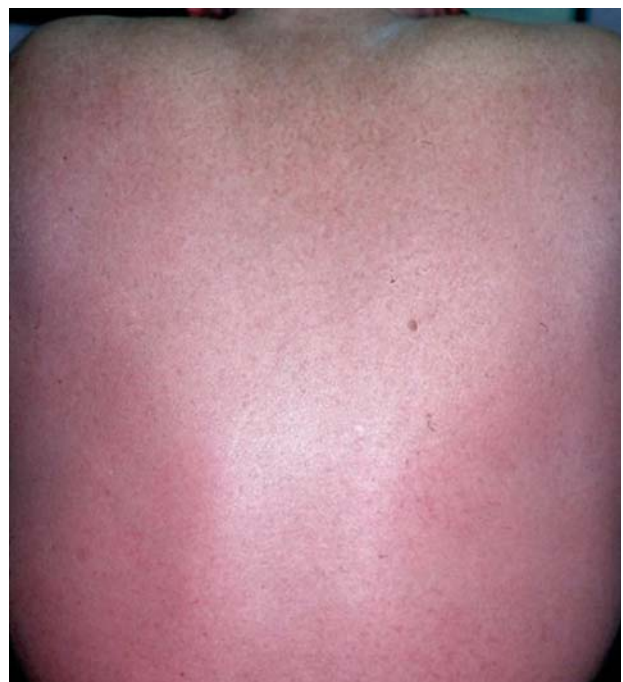
Figure 5. Lesions have cleared, December 1993.

with oral itraconazole. After one month, a skin biopsy was performed, and results were consistent with patch-stage mycosis fungoides.