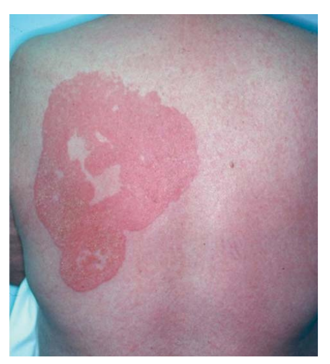
Figure 4. Annular erythema with an underlying poikiloderma, April 1993.