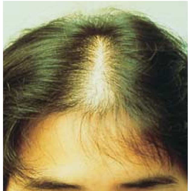
Figure 2. Androgenetic alopecia in an 18-year-old woman with diffuse thinning over the frontal scalp. The frontal hairline is characteristically retained in women with androgenetic alopecia.

physically attractive. 7 These girls revealed that their desire to lose weight stemmed from the influence of the media, their peers, and their desire to be more attractive, gain more attention, and be more confident. Similar influences of the media and peer groups make the presence of thinning hair a source of great distress and insecurity in adolescents.