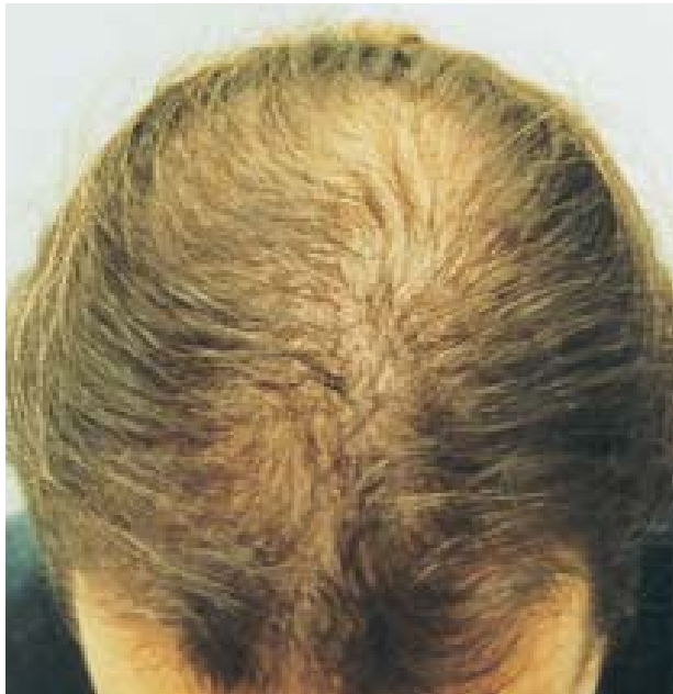
Figure 1. Androgenetic alopecia in an 18-year-old man showing early thinning of frontal scalp and vertex region and accentuation of bitemporal recession.