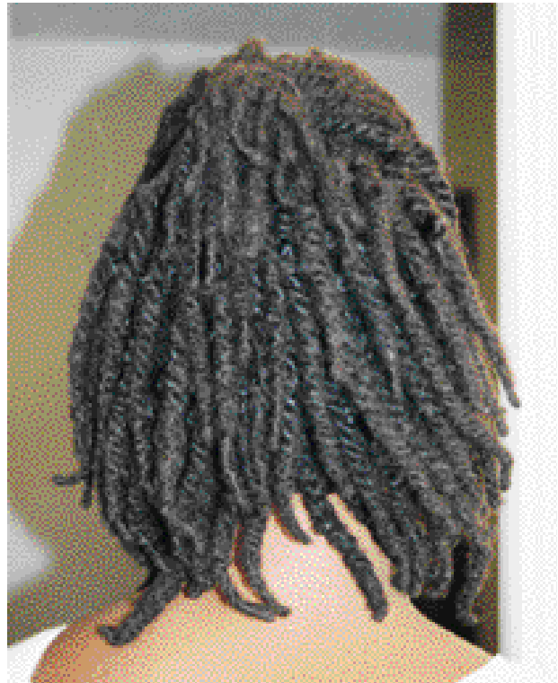
Figure 6. Locks require regular grooming, twisting, and separating of new growth. Once hair has locked, it cannot be reversed other than by cutting the hair.

Swee et al 10 described an outbreak of alopecia from a highly acidic hair relaxing product. Patients from this outbreak experienced hair loss of up to 40% and other side effects including hair breakage, dry coarse hair, green hair, burning irritated scalp,