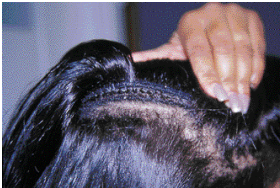
Figure 5. A partial hair weave that has been sewn onto the scalp.

believe that a weave style will help them grow out their hair, cover a balding area, add thickness to their hair, or create style. 8 Hair weaves can be partial or full (Figure 5). A weave can take several hours to perform, and the style lasts at least 2 months. Usually the natural hair is cornrowed and then the hair to be added is sewn, braided, or glued onto the cornrow or exposed scalp. 8