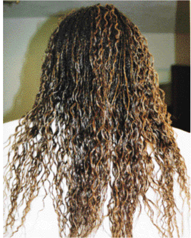
Figure 4. Individual braided extensions with blonde highlights, mimicking long wavy hair.

decline in the use of perming is due to problems such as excessive hair breakage, chemical stains on collars and pillows, and lack of styling versatility.