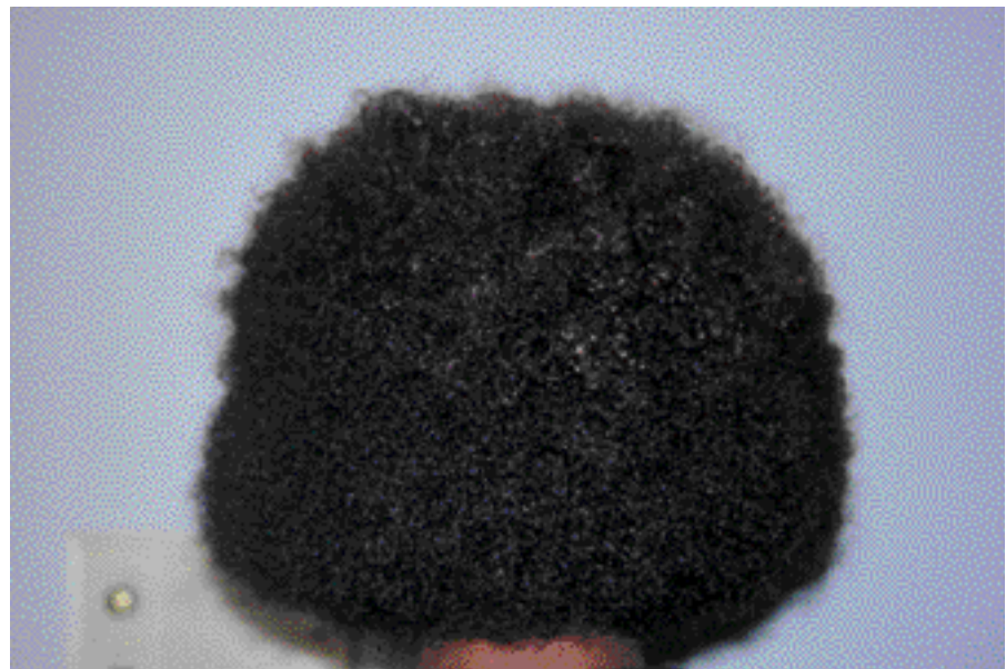
Figure 2. Natural hair that is unprocessed.

There is no mention in the manual of using topical antibiotics such as bacitracin, which is more likely to be efficacious and recommended by a physician. Complications and side effects of thermal styling are listed in Table 2.