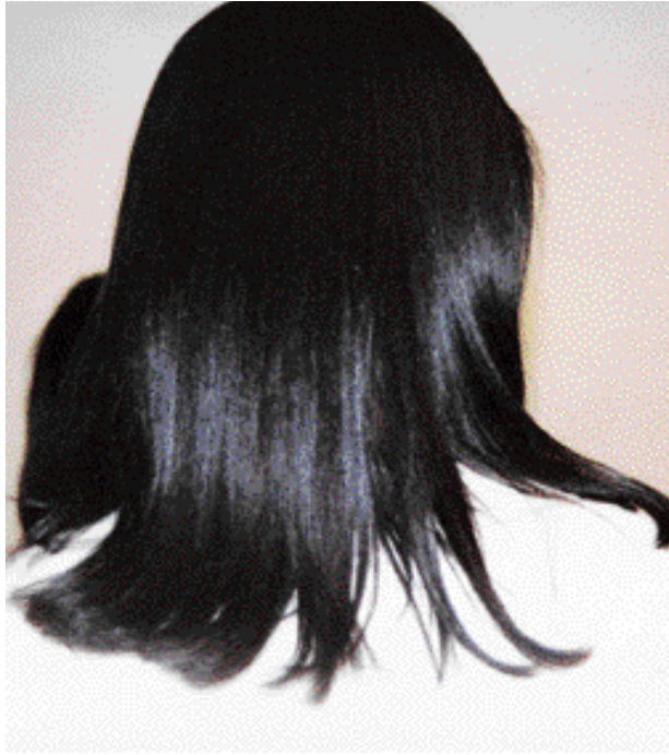
Figure 3. Hair after being straightened with a pressing comb. Some African American women do not exercise or swim for fear of “sweating out the hair” or the hair “going back” to its natural curl, which will ruin their expensive hairstyle.