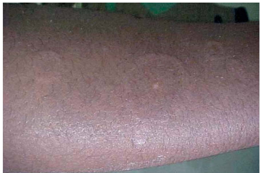
Figure 2. Erythema multiforme on the right arm of patient 2.