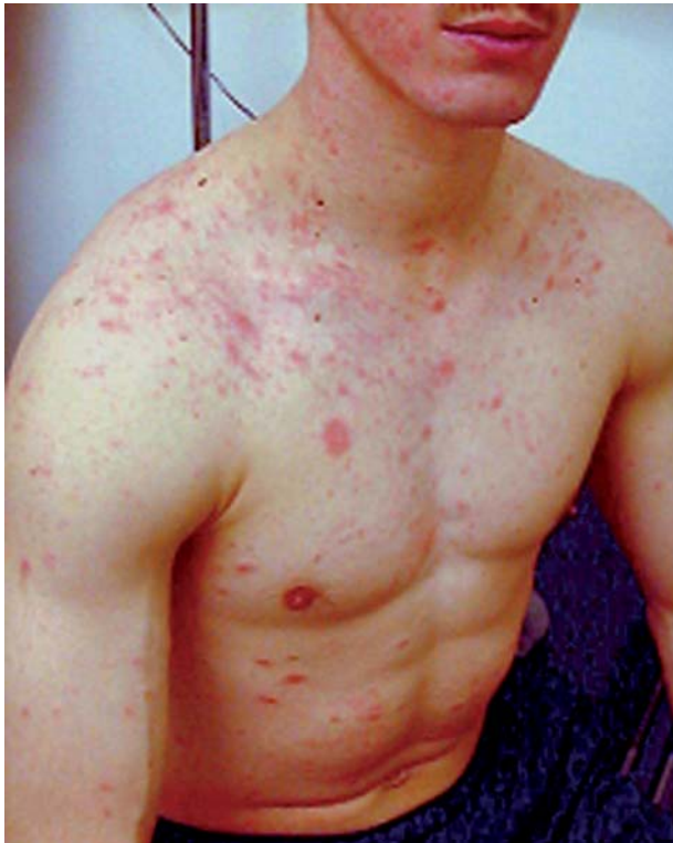
Figure 3. Erythema multiforme reaction on the torso of patient 3.

in October 2001. In all, there were 11 confirmed cases of inhalation anthrax, resulting in 5 fatalities. In addition, there were 7 confirmed cases and 4 suspected cases of cutaneous anthrax. Twenty of the 22 cases were unquestionably linked to mail contaminated with a single strain of Bacillus anthracis . 1 Anthrax is easy and cheap to produce and can be stored for prolonged periods, with spores survivable for decades in ambient conditions. 2 The spores are resistant to dryness, heat, UV light, gamma radiation, and many disinfectants. 3 In addition, anthrax is odorless, colorless, tasteless, and difficult to detect, thus making it a likely choice for future biological attacks. After the first gulf war, Iraq admitted to producing and deploying weaponized anthrax in missiles. 4 The Sverdlovsk anthrax outbreak in the former Soviet Union occurred after the accidental release of aerosolized anthrax spores from a bioweapons facility and resulted in as many as 250 cases with 100 deaths. 2 Fortunately, we have a vaccine that has been judged safe and effective by the US Food and Drug Administration (FDA), Centers for Disease Control and Prevention, and National Academy of Sciences. Protecting the health of US military forces who defend our vital interests is a national obligation. 5 The trade-off for force protection of our military personnel involves