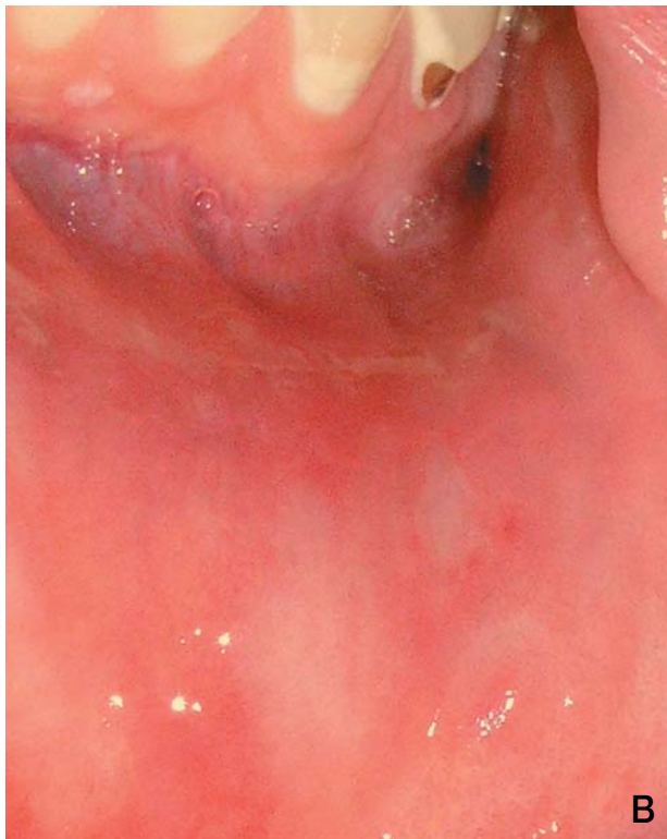
Major aphthous ulcer on the buccal and labial mucosa before (A) and 14 days after (B) the patient's first adalimumab injection.

arthritis in adults who have had an inadequate response to disease-modifying antirheumatic drugs. The recommended dosage in these patients is 40 mg injected subcutaneously every other week.