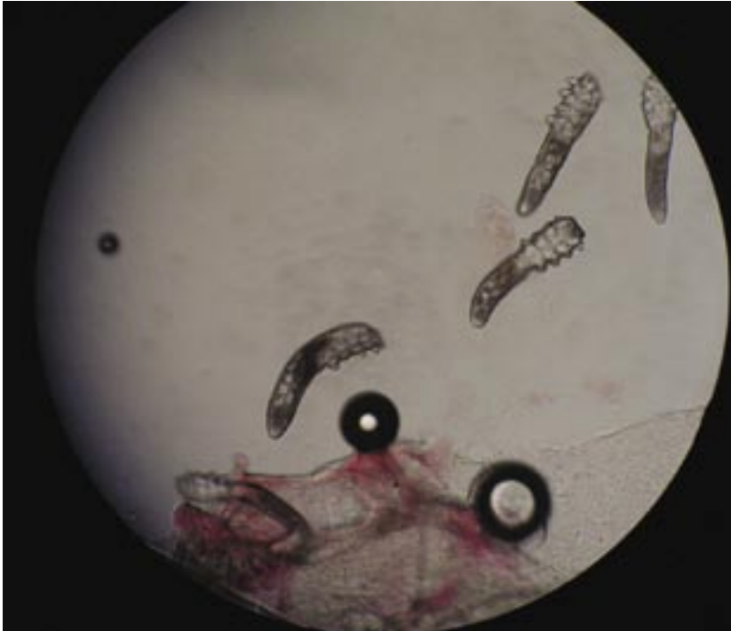
Figure 2. An ectoparasite wet mount shows the presence of several Demodex folliculorum organisms (original magnification \times 40 ).