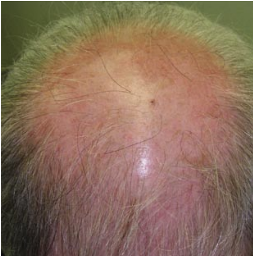
Figure 3. Clearing of patient's scalp following treatment with sulfacetamide 10% plus sulfur 5% cream twice daily and selenium sulfide 2.5% shampoo once daily for 2 weeks.

the detection of the presence of the mite is not, in and of itself, enough evidence to establish pathogenicity. 6 Results of immunohistochemical staining have shown that helper T lymphocytes predominate in the dermal infiltrate of demodicosis suggesting a possible role of cell-mediated immune response and delayed hypersensitivity. 7 There also is evidence for a humoral immune response component with increased macrophages and Langerhans cells in the presence of infestation with Demodex . 7