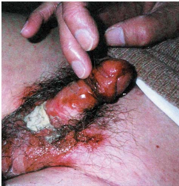
Figure 3. Erosive erythema after 12 days of combination topical chemotherapy.

point, topical chemotherapy was discontinued. Zinc oxide 2% and polysporin ointment were applied alternatively 4 times daily for 2 weeks.