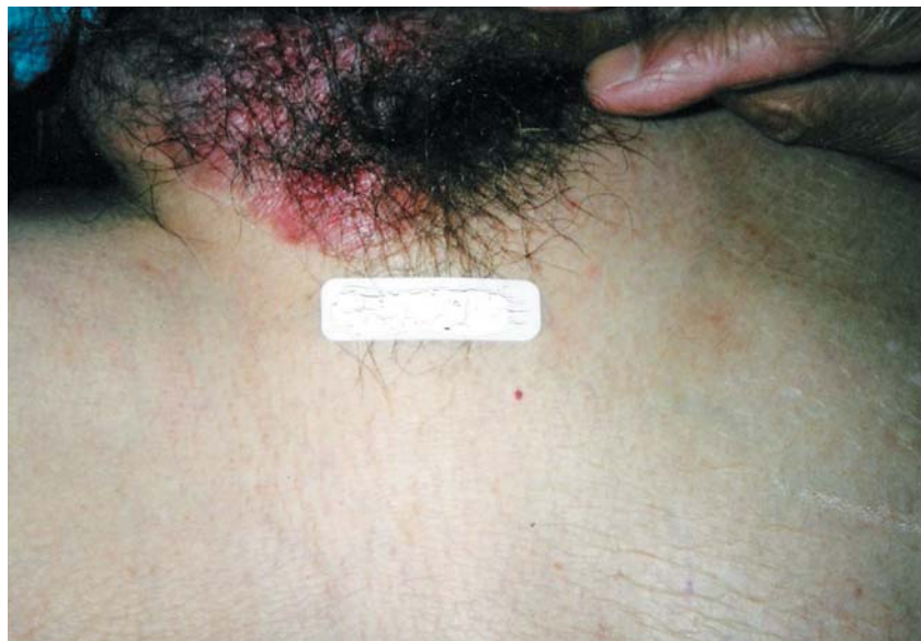
Figure 1. Extramammary Paget's disease involving the scrotum.

The patient was then treated with imiquimod, 5-FU, and retinoic acid combination chemotherapy. The protocol involved applying 5-FU 5% cream every morning, retinoic acid 0.1% gel every afternoon, and imiquimod every evening. After 12 days, the patient complained of severe burning and pain in the affected area, and results of an examination showed severe erosive erythema (Figure 3). At that