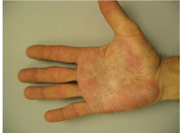
Figure 5. Resolution of the right palm ulceration after treatment with low molecular weight heparin.

Treatment of cutaneous LP with LMWH may be effective, as demonstrated in 3 studies, one of which included a patient with palmoplantar LP. 15-17 The mechanism of action is unclear; however, several theories are purported. First, LP may be a type 4 hypersensitivity response to an unknown antigen in the epithelium, and heparin, even at low doses that provide no anticoagulant activity, may inhibit this delayed-type hypersensitivity. 15 Heparin may act as a competitive inhibitor of heparanase, a component of the dermal extracellular matrix, thought to enhance the ability of T lymphocytes to migrate to target tissue. 15 By inhibiting heparanase, patients may have a decreased inflammatory response and suppressed delayed-type hypersensitivity. Heparin also may act through a different mechanism by inhibiting the production of tumor necrosis factor \alpha . 18 In one published study, 11 of