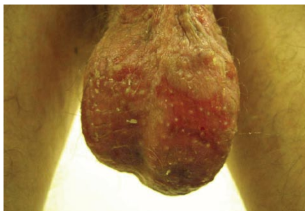
Figure 2. Erosions on the scrotum.