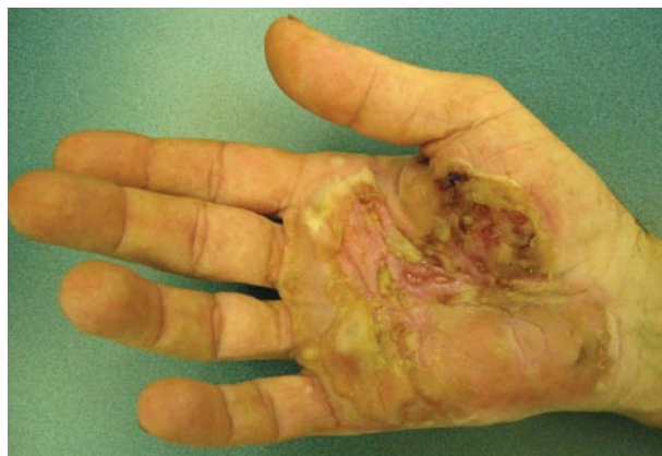
Figure 1. Ulcerative plaque on the right palm with tense bullae at the periphery.

Ulcerative LP rarely involves multiple cutaneous surfaces, as was the case in our patient who