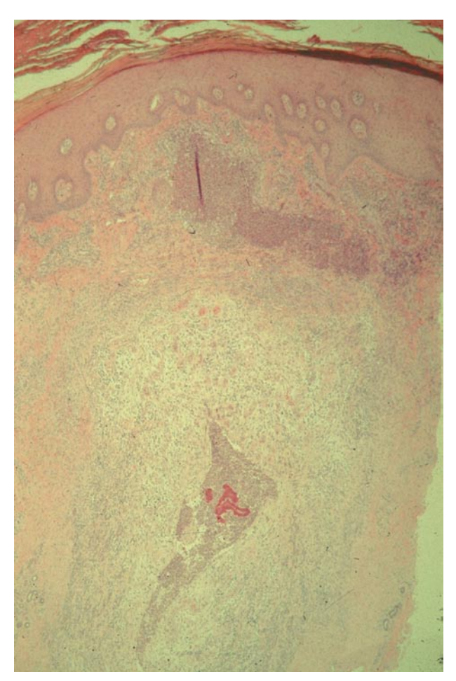
Figure 2. Dermal microabscesses surrounded by fibrosis and granulation tissue (H&E, original magnification ×20).

acid-fast organisms were found on special stains or tissue culture. Routine bacterial cultures grew S aureus susceptible to tetracycline and resistant to methicillin and ciprofloxacin hydrochloride. The patient was treated with minocycline hydrochloride 100 mg twice daily but failed to improve. Results of a repeat biopsy 2 months later again showed pseudoepitheliomatous hyperplasia with inflammation. Results of repeat fungal and mycobacterial stains and cultures were negative, and bacterial cultures grew only scant Staphylococcus epidermidis. Minocycline hydrochloride was continued and empiric oral itraconazole was added. Due to persistent disease, a fourth biopsy specimen was obtained 11 months after initial presentation. Biopsy results revealed dermal microabscesses with collections of organisms surrounded by an eosinophilic capsule typical of botryomycosis (Figures 2 and 3). Although special stains again failed to demonstrate fungi or mycobacteria, bacterial tissue culture grew abundant Actinobacillus actinomycetemcomitans susceptible to quinolones. The lesion resolved after 15 weeks of monotherapy with oral ciprofloxacin (1500 mg/d).