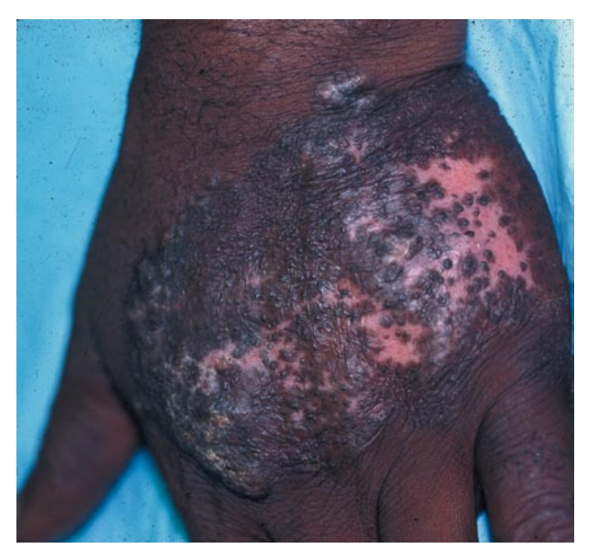
Figure 1. Erythematous verrucous plaque with some mild crusting on the dorsal left hand.

botryomycotic infections.<sup>1</sup> Histologic examination reveals characteristic granules with basophilic centers composed of clumped nonfilamentous bacteria surrounded by an eosinophilic periphery (Splendore-Hoeppli phenomenon). Foreign bodies, impaired host immunity, and virulent organisms are possible pathogenic factors.