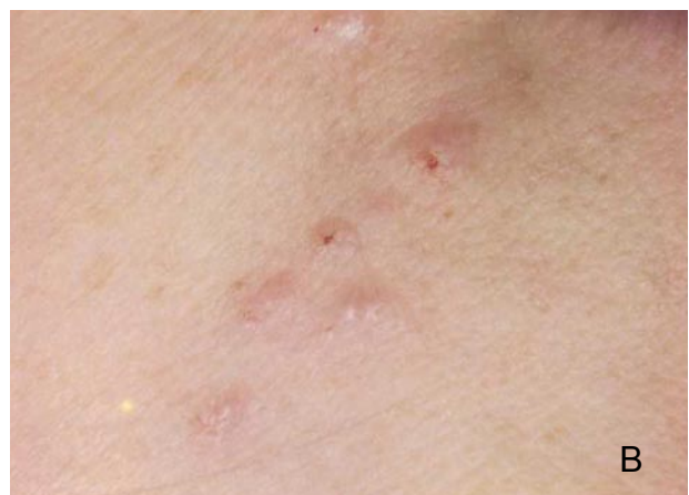
Erythematous indurated papules along the injection sites for the correction of the melolabial folds (A and B).

Accepted for publication February 16, 2006.