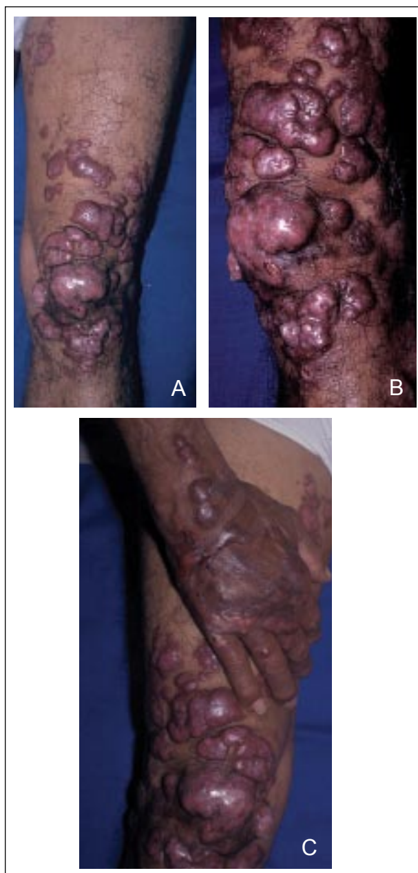
Figure 1. Keloidal and nodular lesions of lobomycosis (A–C).

The diagnosis of lobomycosis is confirmed by biopsy, which demonstrates chains of large spherical organisms (6–12 \mu\text{m} in diameter) resembling a child's pop beads. The chains are more easily identified with Gomori methenamine-silver or periodic acid–Schiff stains (Figure 2). In tissue, the organisms reach larger sizes in humans than in dolphins. 5 Lacazia loboi is closely related to Paracoccidioides brasiliensis and both demonstrate