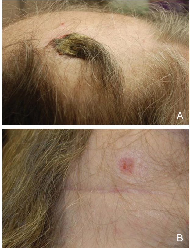
Figure 2. Right parietal scalp (A) and occipital scalp (B) 2 months after appositional electron beam radiation therapy.

The patient's family history included a father with leukemia, a mother with diabetes mellitus and congestive heart failure, and a brother with oral cancer. Her social history did not reveal alcohol or intravenous drug abuse. She had a history of smoking and quit at the time of the LCH diagnosis. Her surgical history included a cholecystectomy, thyroidectomy, cataract surgery, and a femoropopliteal bypass of the lower left extremity. She was not aware of any exposure to hazardous substances. Allergies included sulfonamides, iodine, and tape.