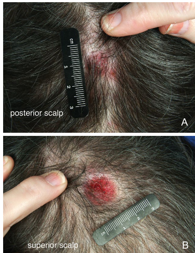
Figure 1. Nodules on the occipital/posterior scalp (A) and right parietal/superior scalp (B).

The patient was referred to The University of Texas MD Anderson Cancer Center, Houston, for treatment of LCH. By this time she had developed an additional nodule on her occipital scalp measuring 1.1×1.2 cm (Figure 1A), with a brown crusted eschar that crumbled when attempting to remove. An erythematous ulcerated tumor was noted beneath the eschar. Scattered erythematous papules were present on the forehead. The nodule on the left parietal scalp measured 3.0×2.5 cm. The nodule on the right parietal scalp measured 2.5×1.5 cm (Figure 1B). The