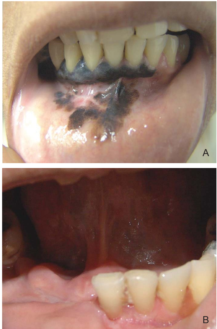
Figure 1. Clinical aspect of oral mucosal melanoma, including a large, black, irregular lesion extending from the anterior mandibular gingiva (vestibular and lingual) to the vestibular sulcus and labial mucosa (A). Four months after surgical excision, there was no evidence of recurrence or local and regional metastasis (B).

gland, and lymph nodes. Additional investigation revealed no distant metastasis. Treatment was performed by tumor excision with a marginal mandibulectomy and extraction of 4 inferior teeth (right inferior incisor, canine, first premolar, and second premolar). Resection margins were 1.5 cm from the pigmented area. Histopathologic analysis of serial sections of the surgical specimen revealed, for the most part, melanoma in situ with junctional activity and intraepithelial nests of neoplastic atypical melanocytes. Neoplastic melanocytes also were seen in the superior strata of the epithelium and some dendritic melanocytes also could be observed. Multiple foci of invasive malignant melanoma also were present in the superficial portion of the lamina propria (measuring <1 mm). The presence of invasion was confirmed by melanocytes positive for melan-A protein on immunohistochemistry, which