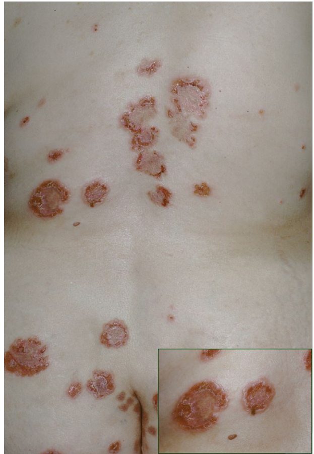
Figure 1. Round, crusted, erythematous patches and plaques. In the inset photograph, vesicles and bullae were demonstrated at the periphery of the skin lesions.

The diagnosis can be confirmed with a skin biopsy and direct immunofluorescence (DIF) testing of perilesional skin. Histopathology reveals subepidermal blisters and basal cell vacuolization with a predominantly neutrophilic infiltrate in the dermal papillae (Figure 2). Direct immunofluorescence testing reveals linear deposition of IgA at the dermoepidermal junction (Figure 3). IgG and C3 deposition infrequently are found at the basement membrane zone (BMZ). 5,6 Indirect immunofluorescence occasionally yields serum IgA anti-BMZ antibodies and may be useful for differentiating between various subepidermal blistering disorders. In a study of 24 patients with various IgA deposition disorders, use of the salt-split skin technique for performing indirect immunofluorescence (incubation of skin in