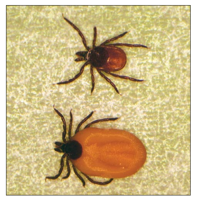
Figure 2. Nonengorged (top) and engorged (bottom) female lxodes ticks.