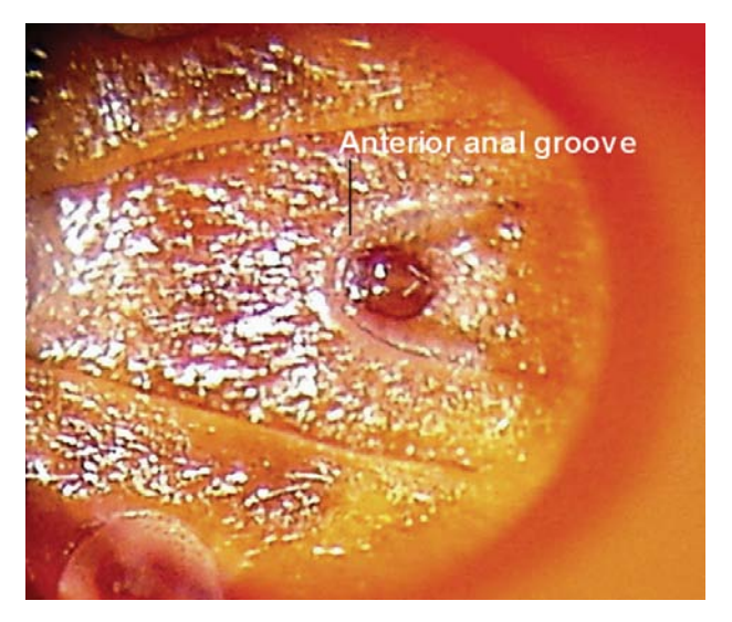
Figure 1. Ixodes ticks have a characteristic anterior anal groove.

In the United States, Ixodes ticks serve as vectors for 3 main diseases: Lyme disease (LD), babesiosis, and human granulocytic anaplasmosis (HGA) (formerly human granulocytic ehrlichiosis).<sup>2</sup> The vector varies according to geography. For example, I scapularis is the main vector of Lyme disease in the mid-Atlantic states, the Great Lakes region, and the northeastern United States, while Ixodes ricinus (also known as the sheep tick) mainly is found in Europe. The major vector for Lyme disease in the western United States is Ixodes pacificus (the California black-legged tick). Ixodes ticks are welladapted to a variety of environments from coastal shorelines to New York City parks.<sup>3</sup> Migrating birds may contribute to the wide geographic territory covered by the tick. Larval and nymphal stages of the tick attach to birds in the spring and summer,<sup>4</sup> and robins have been shown to be competent hosts for the Lyme spirochete. Another common bird,