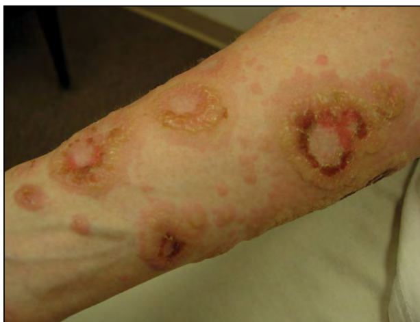
Figure 2. Urticarial plaques with multiple bullae and vesicle formation on the right anterior forearm.