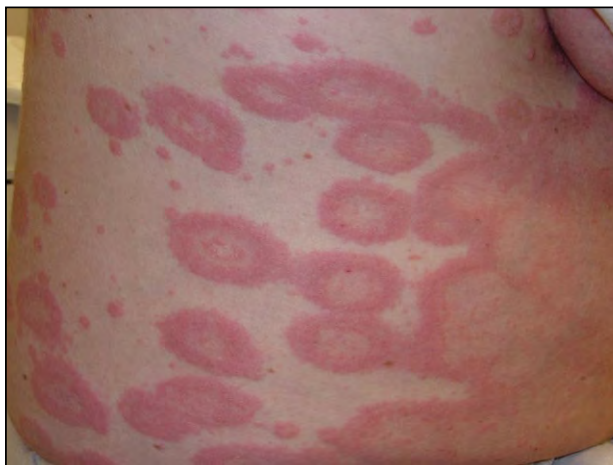
Figure 1. Large urticarial plaques involving the abdomen and right flank, extending to the chest and back.