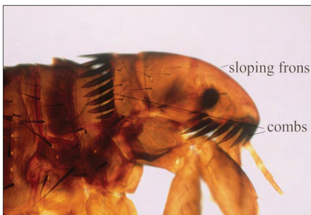
Figure 3. Distinguishing features of the cat flea.

Histopathologic examination of a flea bite reveals a wedge-shaped, perivascular, dermal infiltrate with scattered eosinophils. Endothelial swelling is prominent and vesicles and/or bullae may be present.