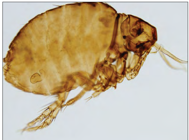
Figure 1. The sticktight flea ( Echidnophaga gallinacea ).

Echidnophaga gallinacea infests a wide variety of birds and mammals worldwide, and while it is mainly a poultry flea, it is becoming more common on dogs. 1-3 It has a predilection to attach to bare spots on the skin (eg, eyes, anus). It is the only species in the genus found in North America, especially in the southern and western United States, and has been noted to be the most common flea on dogs in areas of South Africa. It also is becoming more common on dogs in the United States. 4-7 In New Mexico, E gallinacea can be found on cottontail rabbits, while in Angola it can be found on rodents. 8,9 A report of a sticktight flea found on the cheek of a 2-year-old boy in Los Angeles, California, also was reported. 10 Public health significance relates to its ability to serve as a vector for the plague and murine typhus as well as