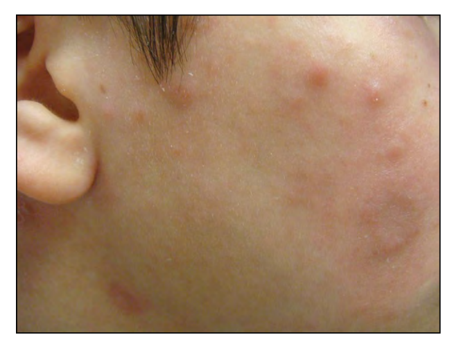
Figure 1. Scattered erythematous papules and annular plaques on the cheek.