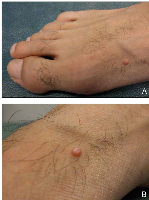
Figure 3. An asymptomatic lesion of plantar molluscum contagiosum presented as a flesh-colored, dome-shaped, umbilicated papule on the medial aspect of the right dorsal foot proximal to the great toe that measured 5×3 mm (A and B).

Both tissue specimens showed similar pathologic changes. There was compact orthokeratosis. In the dermis acanthotic lobules of the epidermis were present. The keratinocyte nuclei were displaced and compressed by the large cytoplasmic viral inclusion bodies