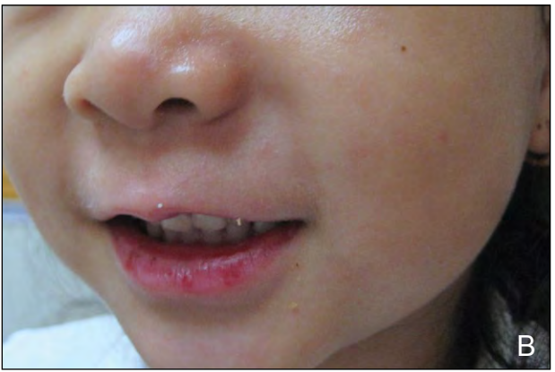
Figure 1. Multiple grouped small vesicles on an erythematous base on the left side of the face with several vesicles crusted over and others coalesced into plaques (A). The vesicles resolved following a 2-week course of oral acyclovir (B).