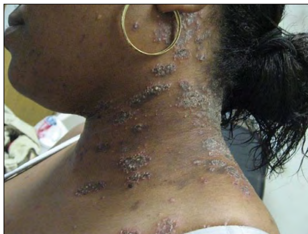
Figure 1. Initial presentation of scattered vesiculopustules on a scaly erythematous base on the left lateral neck.

A 23-year-old healthy woman with no notable medical history presented with a pruritic rash of 1 month's duration that started on her neck and generalized to the rest of her body. The only precipitating event she recalled was a history of an arthropod assault the day before the development of her skin lesions. The patient made 2 separate visits to a local emergency department and was given 2 separate weeklong