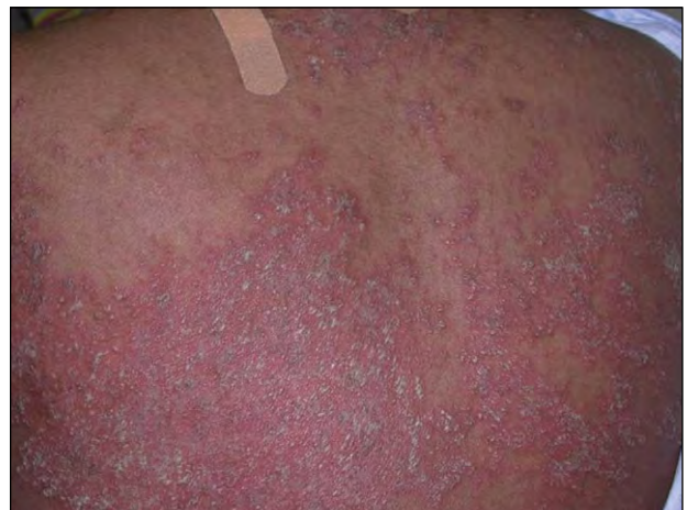
Figure 3. Exacerbated skin lesions with scattered pustules that coalesced into large plaques of pus overlying erythematous patches on the upper and mid back 4 days after the first subcutaneous injection of etanercept.