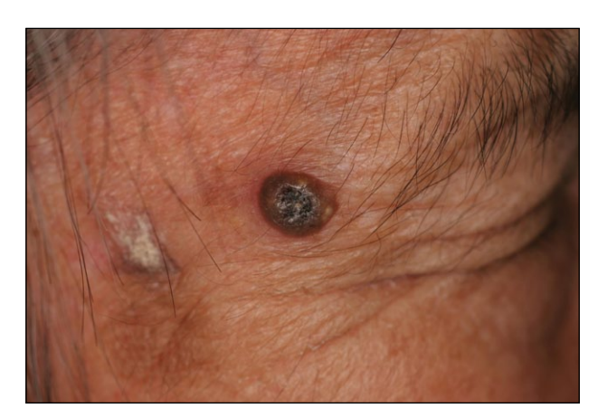
Figure 1. Gross features of the tumor. The slightly elevated black tumor measured 0.9 \times 0.9 \times 0.6 cm.

Histologically, the tumor was symmetrical with atypical cells located in the center. An aggregate of malignant atypical cells was present in the basal part in the center of the tumor (Figure 2). The atypical cells showed keratin pearls, individual keratinization,