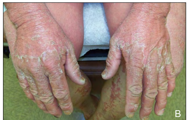
Figure 2. Salmon pink plaques on the back (A) and thick keratosis on the dorsal aspect of the hands before treatment (B).