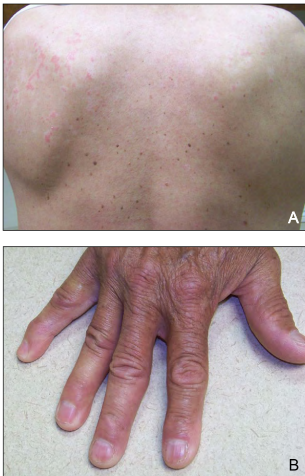
Figure 3. The back (A) and dorsal aspect of the hand after 3 months of treatment with adalimumab (B).

Although adalimumab would have been effective if our patient had been diagnosed with psoriasis, adalimumab has not been widely tested for the treatment