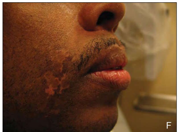
Depigmented patches involving the nasolabial folds, philtrum, columella, and nasal alae after exposure to liquid amyl nitrite (A and B). After 12 treatments with an excimer laser, follicular repigmentation was observed (C and D); notable repigmentation was observed after 42 treatment sessions (E and F).

“liquid gold” 61 whose vapors are inhaled intranasally or orally. Because of their vasodilatory and methemoglobin-inducing effects, these compounds often are abused for enhanced sexual arousal and relaxation of the sphincter muscles. 61 Common side effects associated