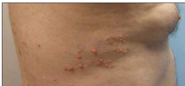
Figure 1. Flesh-colored, biopsy-confirmed neurofibromas located on the right lateral chest in a T5-T7 dermatomal distribution in a man with segmental neurofibromatosis.

Biopsy-confirmed SNF and idiopathic polydactylous longitudinal erythronychia were observed in a 56-year-old man. 3 The patient presented with more than 25 flesh-colored dermal papules and nodules in a T5-T7 dermatomal distribution on the right lateral chest (Figure 1); no café au lait macules were present, and there was no family history of neurofibromatosis. Single and multiple longitudinal red bands on all fingernails were coincidental findings (Figure 2). 3