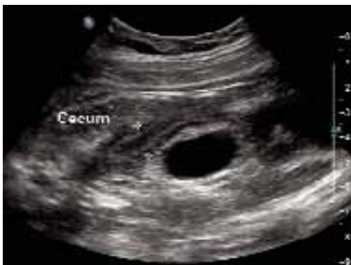
Ultrasound view of right lower quadrant with cecum labeled.