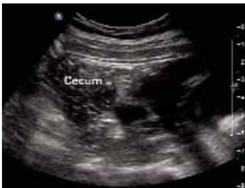
Second ultrasound view of the patient's right lower quadrant.