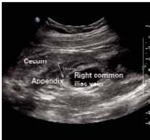
Longitudinal view by ultrasound of enlarged appendix with diameter equal to 13 mm (normal is less than 6 mm).