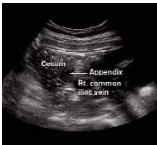
Transverse view of inflamed appendix by ultrasound with wall thickening.