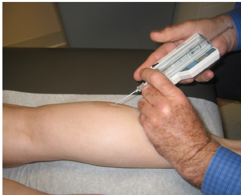
FIGURE 2 Measurement with Stryker stic

Measurement of lateral superficial posterior compartment pressure with the Stryker stic on a 16-year-old girl with 4-month history of exertional calf pain.