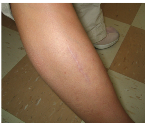
FIGURE 4 6 months later

16-year-old female hockey and soccer player 6 months after anterior and lateral fasciotomy.