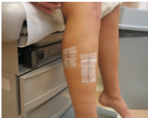
FIGURE 3 5 days postsurgery

21-year-old female collegiate track athlete 5 days after anterior, lateral, and lateral superficial posterior compartment release.