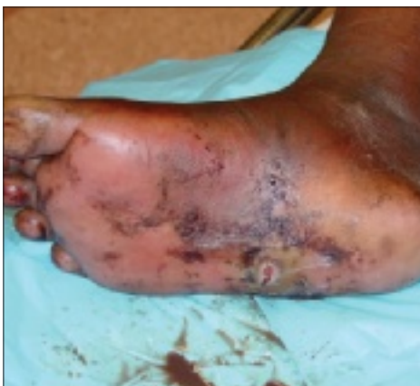
Swollen, dusky foot

The 49-year-old patient stepped on a fish bone while walking on the beach. One month later, his right foot was swollen, dusky, and erythematous. Note the brownish discharge from the puncture wound.