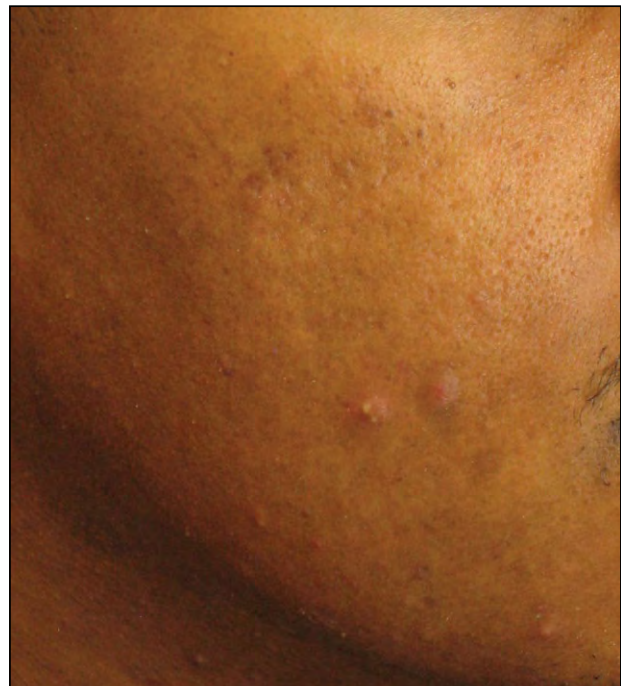
Figure 3. Mild treatment-related postinflammatory hyperpigmentation.

heating to effect collagen remodeling. The risk for PIH is related to the degree of cutaneous inflammation. Postinflammatory hyperpigmentation may occur due to epidermal injury from either thermal damage or cold injury caused by cryogen spray cooling.