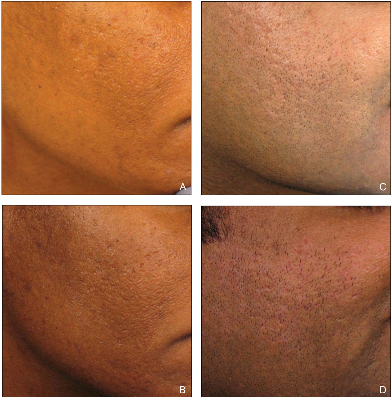
Figure 1. Patients with acne scarring on the right cheek at baseline (A and C) and 18 months posttreatment (B and D).

including fibroblast proliferation and upregulation of collagen expression and remodeling.