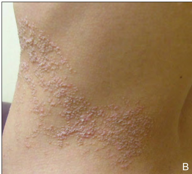
Figure 1. Large area of flesh-colored verrucous plaques on the left side of the body of a 25-year-old woman following the lines of Blaschko (A and B).