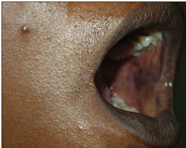
Figure 1. Mucosal pigmentation.

experienced minor adverse effects (ie, mild gastritis and nasal congestion).