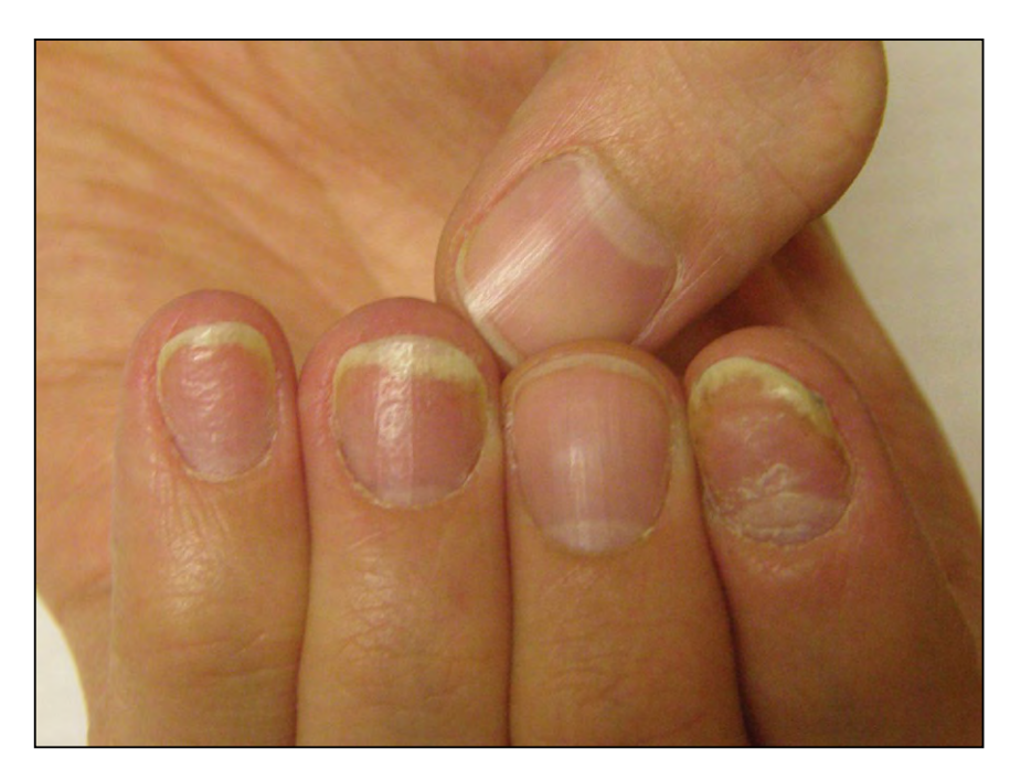
Figure 2. Nail matrix psoriasis demonstrating pitting and onycholysis.

more prevalent in patients with psoriatic arthropathy compared to cases of uncomplicated psoriasis. The sole presence of nail disease increases the likelihood of developing psoriatic arthropathy. Although nail involvement is more common in patients with psoriatic arthropathy, it does not indicate the severity of systemic psoriatic involvement. It