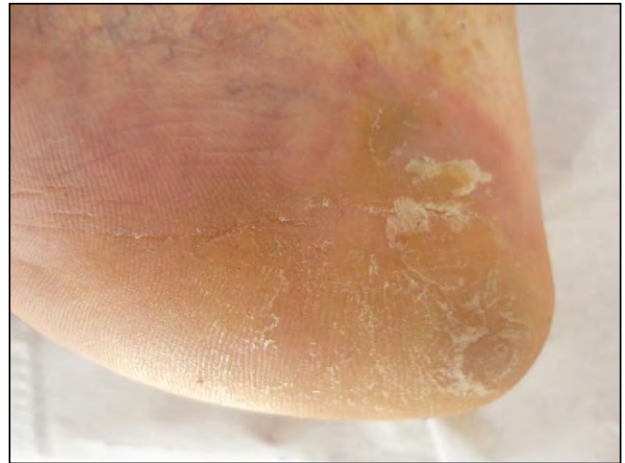
Figure 3. Plantar keratoderma restricted to the heel with inflammatory borders.

folliculitis 7 weeks after beginning treatment; however, the authors observed spontaneous regression of the lesions. Cutaneous lesions in both cases were strikingly similar to ours, with multiple painful, mildly pruritic, papular lesions with extruding material. 9,10 In our case, the histology was consistent with keratosis