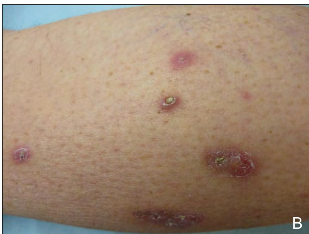
Figure 2. Inflammatory papules on the leg with a central keratotic plug (A and B).

folliculitis 7 weeks after beginning treatment; however, the authors observed spontaneous regression of the lesions. Cutaneous lesions in both cases were strikingly similar to ours, with multiple painful, mildly pruritic, papular lesions with extruding material. 9,10 In our case, the histology was consistent with keratosis