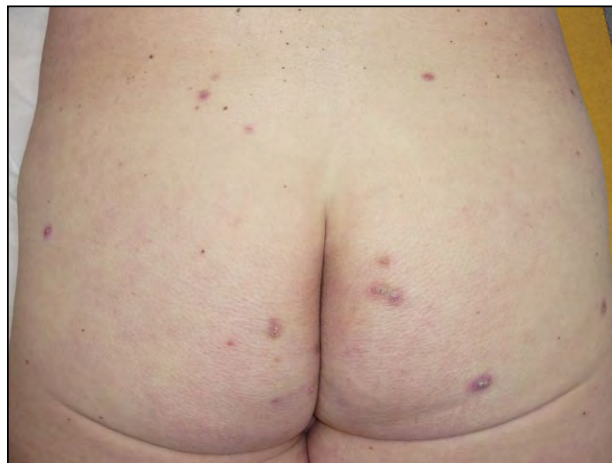
Figure 1. Inflammatory, hyperkeratotic, follicular papules on the buttocks.

Correspondence: Nicolas Kluger, MD, Skin and Allergy Hospital, HUS, PO Box 160, Helsinki, Finland 00029 (nicolaskluger@yahoo.fr).