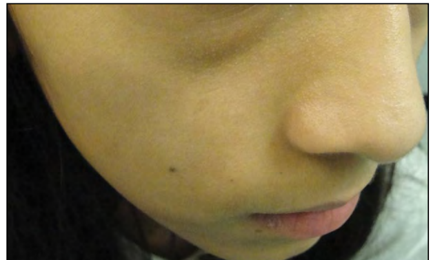
Figure 1. Scattered atrophic wormlike macules on the maxillary cheeks in a 13-year-old adolescent girl.

A conservative approach similar to treatment of keratosis pilaris is most commonly utilized. Patients and their guardians should be instructed to use a mild soapless cleanser 1 to 2 times daily to prevent excessive skin dryness. 26 Mild keratolytics, such as