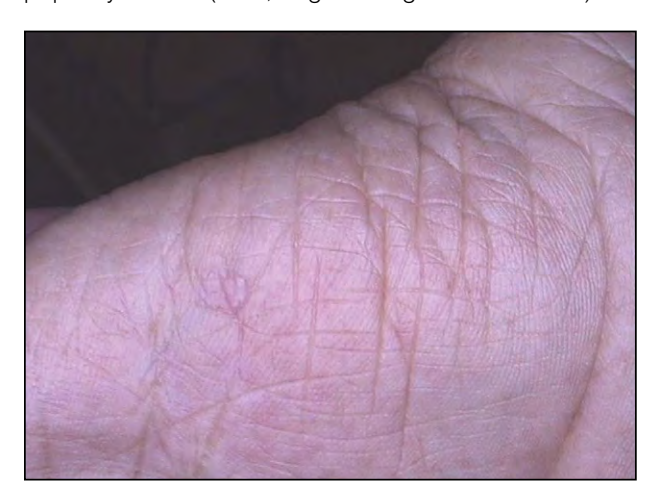
Figure 4. A round, 0.5-cm, circumscribed, depressed patch on the thenar eminence of the right palm.

be affected.<sup>2,7,11,16</sup> Involvement of the predominant hand has been more frequently reported.<sup>7</sup> Most patients present with a solitary lesion, though multiple lesions also have been reported.<sup>6,7,15,17,18</sup> Lesions