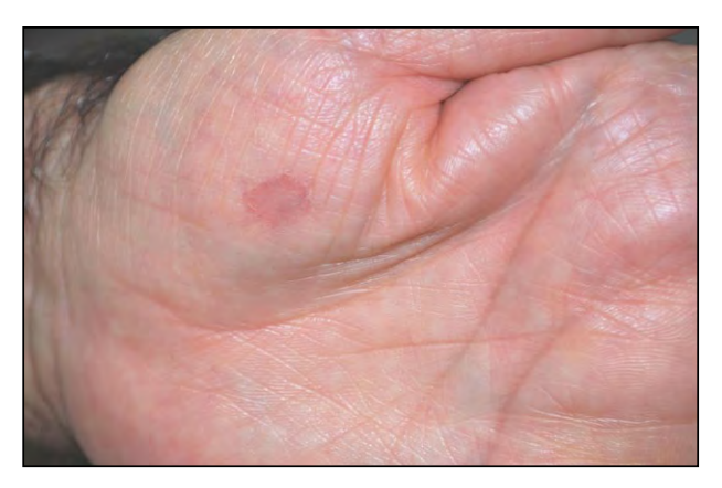
Figure 1. A red, depressed, oval-shaped patch on the thenar eminence of the left palm.

orthokeratosis, prominent protrusion of orthokeratotic acrosyringeal corneocytes above the parakeratotic layer, and psoriasiform acanthosis without atypia were noted. Cornoid lamella was absent. The granular layer was slightly diminished, excluding the acrosyringia. There were dilated blood vessels and perivascular, slight lymphocytic infiltration in the papillary dermis (Figures 2 and 3). Periodic acid–Schiff and Alcian blue stains did not demonstrate a specific abnormality. Polymerase chain reaction (PCR) analysis for pan–human papillomavirus (HPV) DNA in a paraffin-embedded biopsy sample yielded negative results.