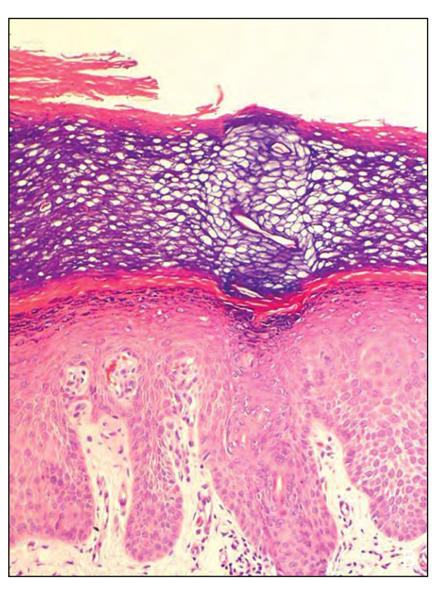
Figure 2. A stairlike frayed decrease in the thickness of the stratum corneum was noted at the lesion border. In the zone of hypokeratosis, acrosyringeal corneocytes protruded above the parakeratotic layer and the granular layer was slightly diminished (H&E, original magnification ×200).

Dermatologic examination revealed a circumscribed, 0.5-cm, depressed, slightly erythematous patch on the thenar eminence of the right palm (Figure 4). The lesion was completely excised at the request of the patient's daughter. Histopathologic examination showed a sharp step off from the thick stratum corneum of normal acral skin to a thin stratum corneum in the lesional skin. The abrupt thinning of the orthokeratotic stratum corneum was coupled with mild hypogranulosis and acanthosis without epidermal atypia (Figure 5). Cornoid lamella