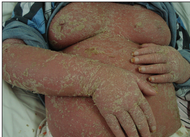
Figure 3. Severe widespread erythema, scaling, and edema in a 26-year-old woman with psoriasis.