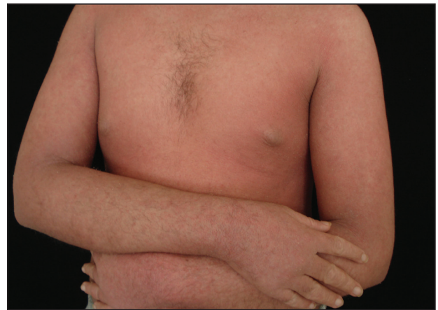
Figure 1. Severe widespread erythema and mild desquamation in a 13-year-old adolescent boy with psoriasis.

C3, C4, and total IgE levels were within reference range. Cyclosporine 200 mg daily was initiated for treatment of erythrodermic psoriasis. On days 20 and 45 of treatment, eosinophil levels were 8.26% (0.994 cells/ \mu L) and 17.5% (1620 cells/ \mu L), respectively. The patient's erythema and edema remarkably decreased at the end of the first month of treatment with cyclosporine, but simultaneous onset of pruritus and increasing eosinophil levels despite treatment with cyclosporine were noted. Scabies mites were demonstrated on microscopic examination of skin scrapings from the dorsal aspect of the hand (Figure 4), and the patient was treated with permethrin cream 5%. At 6-month follow-up, eosinophil levels were within reference range (0.317 cells/ \mu L; 4.75%); pruritus and lesions were not observed.