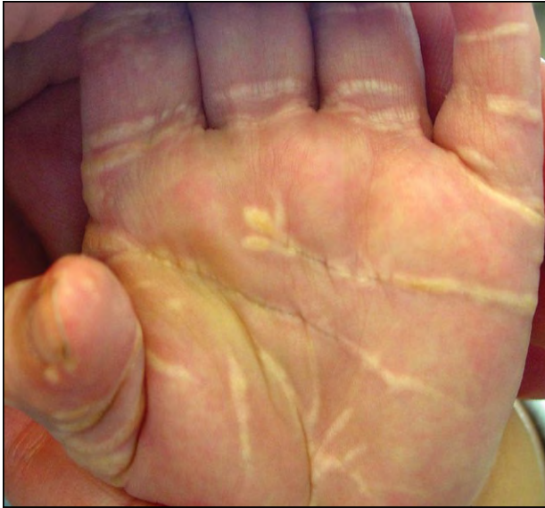
Figure 3. Linear white plaques filling the palmar creases consistent with xanthoma striatum palmare.

to postpone genetic testing for mutations of JAG1 (jagged 1) and NOTCH2 (notch 2), known etiologic mutations in Alagille syndrome.