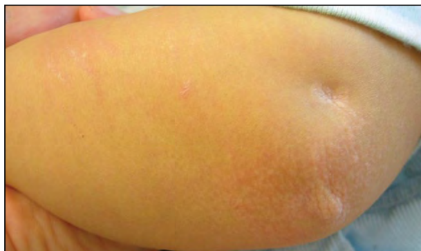
Figure 1. Soft, 3- to 6-mm, white and yellow papules on the extensor surfaces of the elbows consistent with tuberous xanthoma.

Cutaneous examination revealed jaundice and scleral icterus. Figure 1 illustrates the white and yellow, soft, 3- to 6-mm papules over the extensor surfaces of the elbows consistent with tuberous xanthoma. Figure 2 shows the white 2- to 3-mm papules