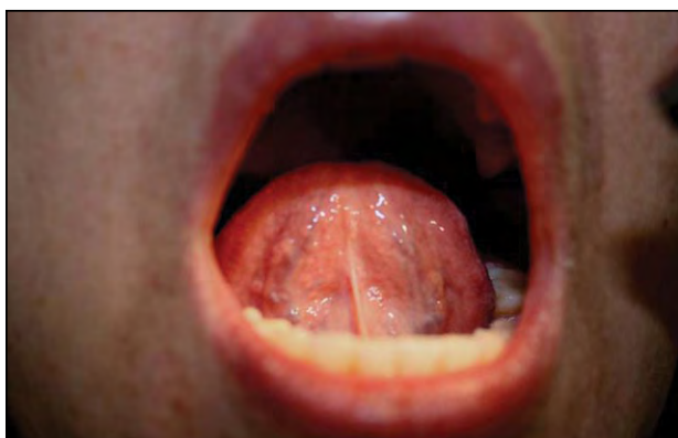
Figure 2. Sublingual 2- to 3-mm pink papules.