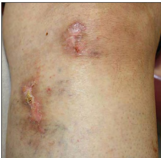
Figure 1. Hyperkeratotic pink plaques on the knee.

Routine light microscopy revealed hyperkeratosis, parakeratosis, hypogranulosis, papillomatosis, and acanthosis with elongation of rete ridges (Figure 3). Neutrophils were present in the stratum corneum, and the papillary dermis had a mild lymphocytic perivascular inflammatory infiltrate with collections of foam cells (Figure 4). These features were consistent with a diagnosis of VX. IgG, IgM, IgA, and C3 antibodies were not observed on immunofluorescence. Mycobacterial and fungal cultures grew