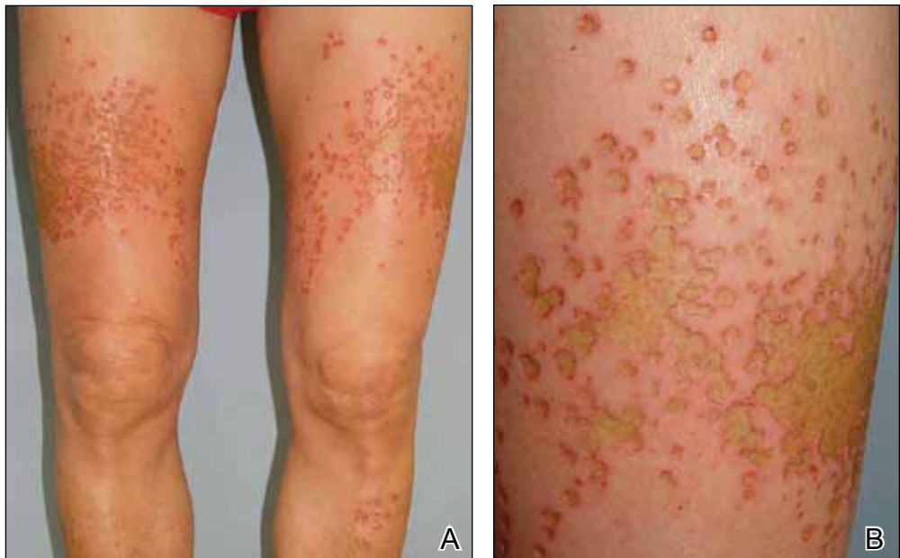
Figure 1. Multiple confluent, punched-out, round ulcers with peripheral erythema on the thighs and shins (A and B).

in the following months with scar formation and hyperpigmentation.