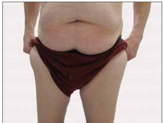
Figure 2. Masses of adipose tissue on the lateral aspect of the proximal thighs and abdomen.