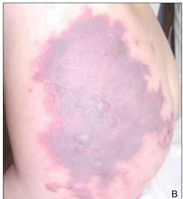
Figure 1. Left arm with tender stellate purpura (A). Left side of the lower back with large area of purpura and few scattered tense bullae (B).