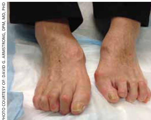
FIGURE 4 Claw toe