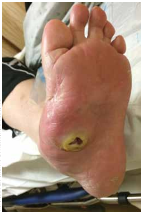
FIGURE 5 Charcot neuroarthropathy