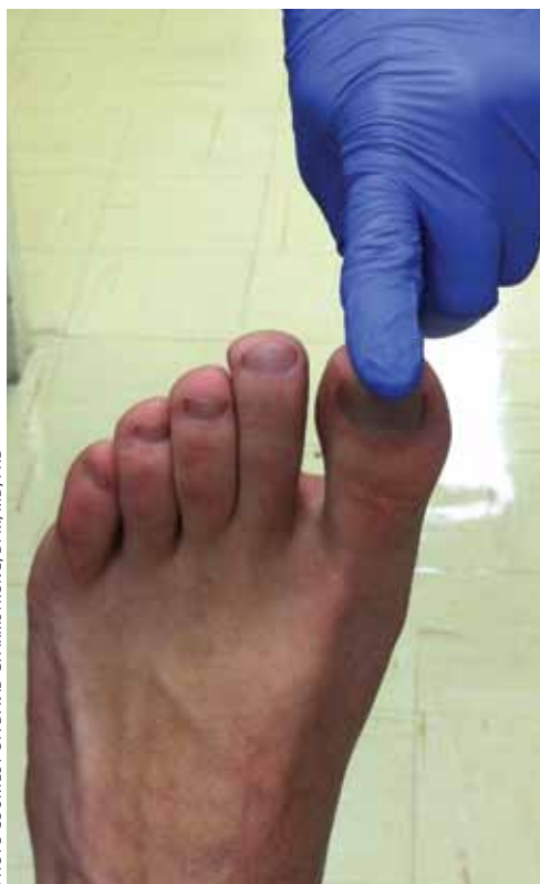
FIGURE 3 The Ipswich Touch Test