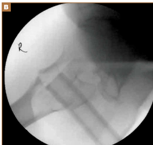
Figure 2. Intraoperative lateral fluoroscopy shows (A) external rotation of proximal fracture fragment and (B) internal rotation of proximal fragment after placement and inflation of pneumatic patient positioner with femoral neck now parallel with floor facilitating placement of intramedullary nail and ensuring optimal positioning of fracture fragments.

if fixed after internal rotation, often end up with a malrotation deformity that must be corrected. 4 With our technique, there is no need to excessively rotate the distal fragment. Inflating the PPP internally rotates the proximal fragment until the femoral neck lies parallel with the floor. Doing so allows the femoral neck guide wire to also lie parallel with the floor, easing placement. The surgeon then has to negotiate the neck–shaft angle and the anterior-to-posterior placement of the guide wire within the femoral neck.