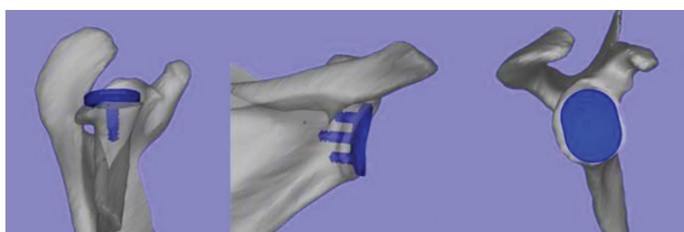
Figure 2. Three-dimensional (3-D) computer modeling for study arm 2 shows 3-D rotation of scapula and glenoid component during positioning of a size 52 glenoid component template.